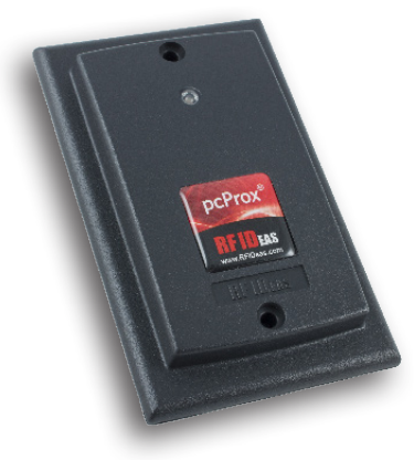
See reverse for other form factors

Wall Mount card and badge reader for identification and enrollment